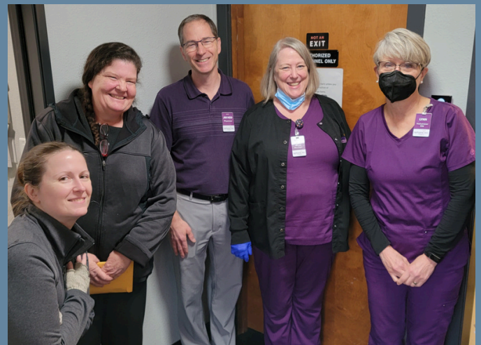
OPTIONS 360 WOMEN'S CLINIC

Provides temporary housing and is committed to equipping homeless families with the tools necessary for resolving issues that lead to poverty and homelessness.