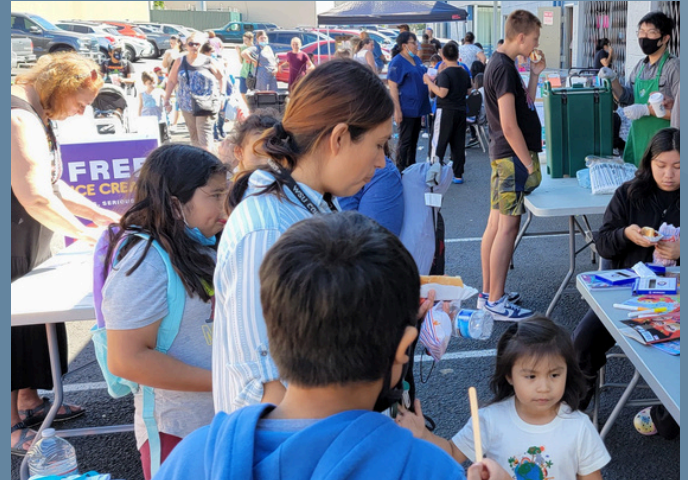
THE GIVING CLOSET

Brightening the lives of both residents and staff during this challenging season. Each week personal cards, small gifts, snacks & treats are delivered and relationships are being built, speaking volumes to those that are often isolated from the rest of the community.