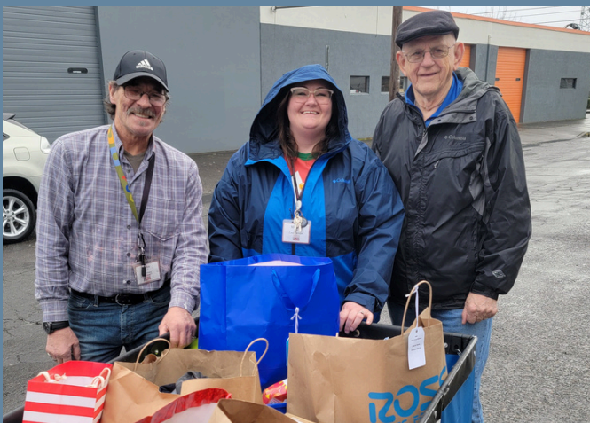
OPEN HOUSE MINISTRIES

Collects and provides clothing, food and other basic resources to those living at or near the poverty level, including the homeless who are transitioning to a new home. Their goal is to help restore hope and dignity in our community.